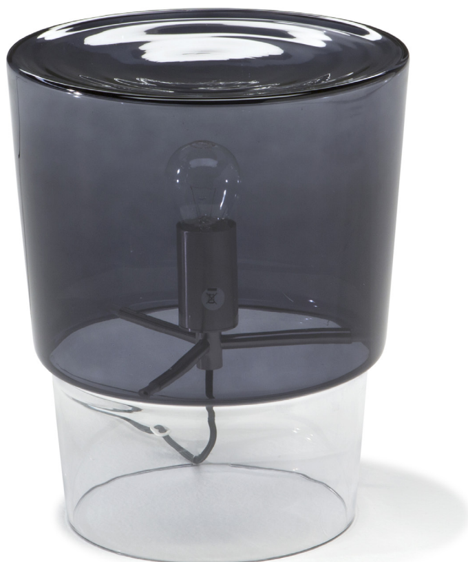
■ L501TG_ (*)