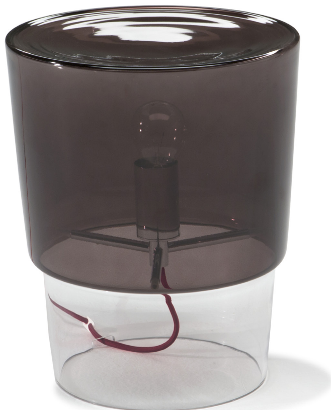
■ L501TM_ (*)