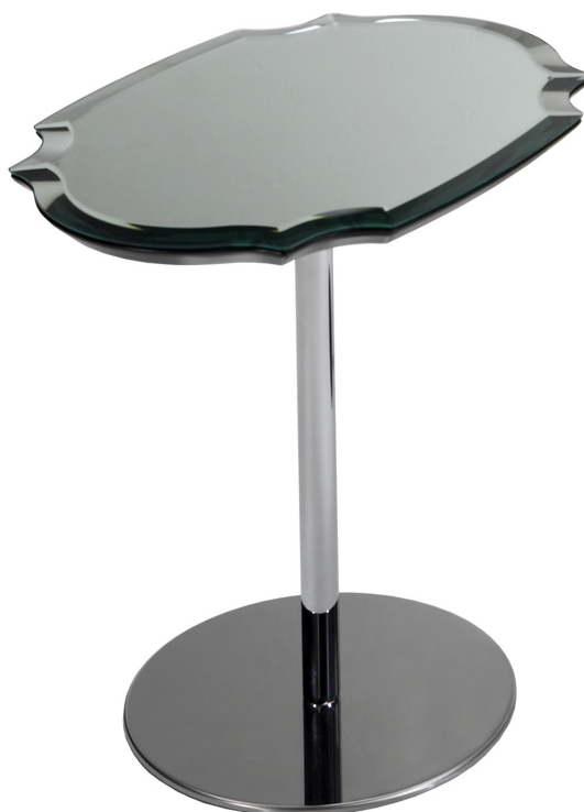
■ T104MXS Grace