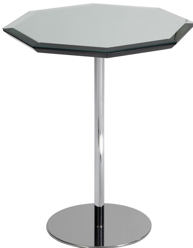
■ T105MXS Ginger